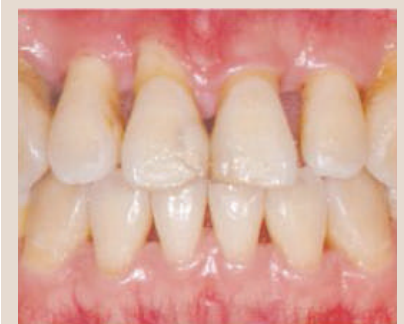
Severe Periodontal Disease