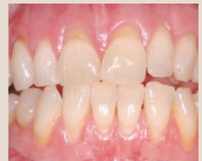
Moderate Periodontal Disease