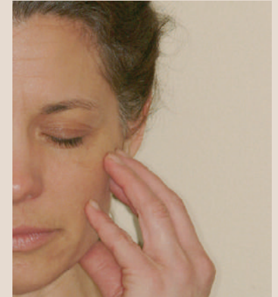
Facial, Muscle, or Joint Pain

Ignoring a jaw joint problem may lead to chronic, debilitating pain and an inability to function normally when chewing and speaking.